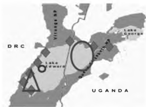
Fig. 1. Map of lakes Edward and George, connected through Kazinga Channel with sampling points: